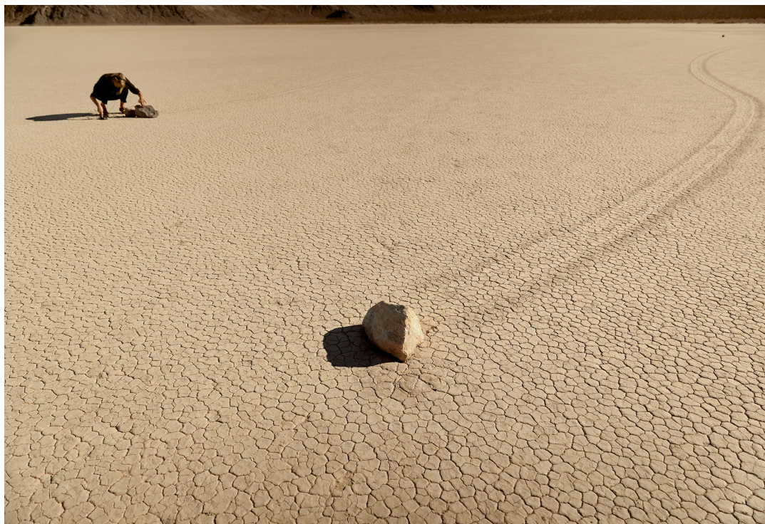
EAR TO THE GROUND